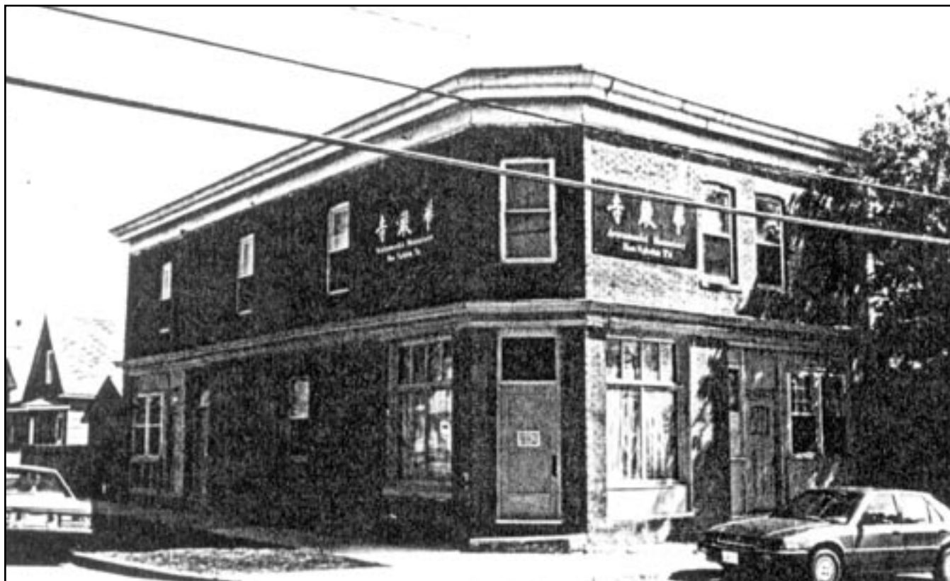
1024, 17th Ave SE